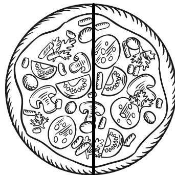
Share with a pal!