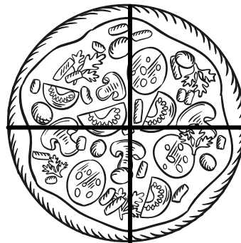
Share with some friends!