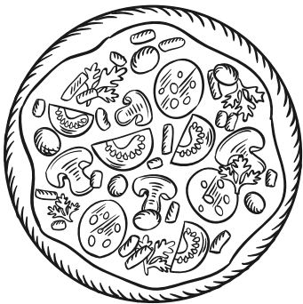
You get the whole pizza pie!